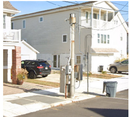
EXISTING PUMP STATION Sidewalk at 39 West 17th Street

Additionally, we will replace approximately 2,050 feet of aging 6-inch water main and 8-inch sewer main, installed as far back as the 1950's, with new 8-inch PVC main on the 17th Street island . The project also includes replacing all fire hydrants and utility-owned service lines and sewer laterals along the pipeline route. Please see reverse for more information about service lines.