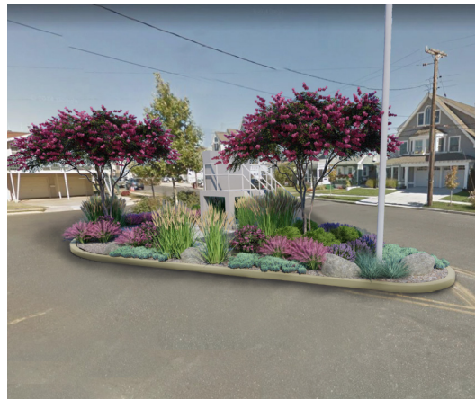
NEW PUMP STATION RENDERING Traffic median on West 17th Street